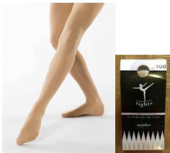
“Natural” Shade Tights (The company has changed the name from Classic Pink.)